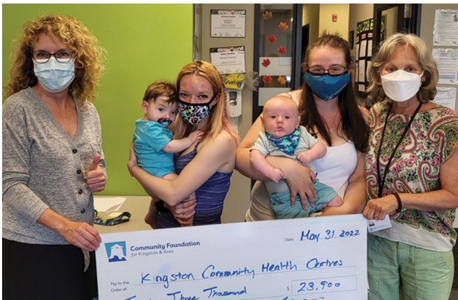
Serve and Return clients and program staff.