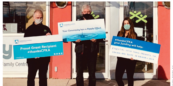
Boys and Girls Club of Kingston & Area accepting the grant for pandemic-proofing programs.

Our snapshot is necessarily created around numbers, but behind the numbers are people like you who, together, work to improve our community well-being. Our work would be impossible without each of you as partners. Thank you.