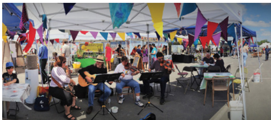
Farmer's Market Association of Kingston

For more information www.cfka.org/events