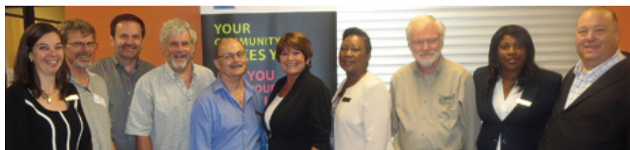
In June the Foundation launched the First Capital Community Development Loan Program for local small businesses. Learn more at www.cfka.org/loan .