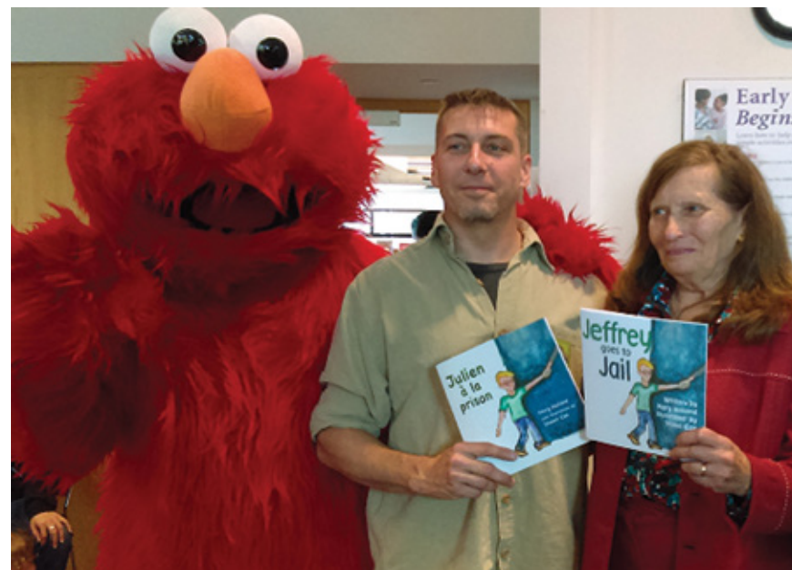
Canadian Families and Corrections Network (CFCN)

Sesame Street Partners with Canadian Families and Corrections Network (CFCN)